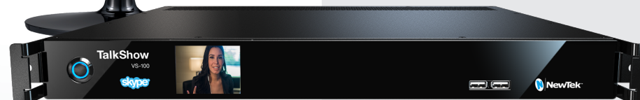
Monitor not included.